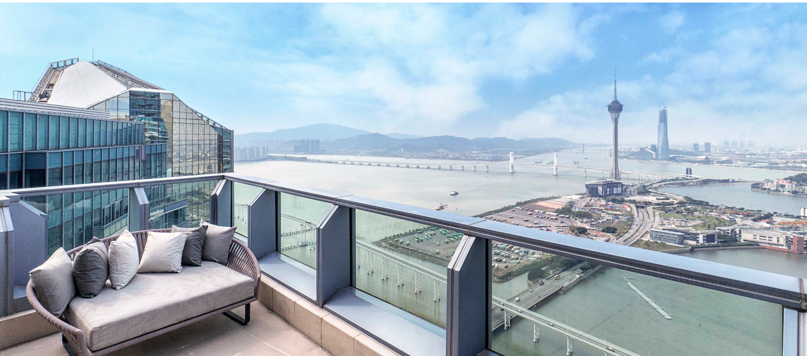
Magnificent view from a Duplex Suite at The Waterside .

A circular containing the proposals and detailed information on the Discontinuation Vote will be circulated to shareholders in mid October 2016.