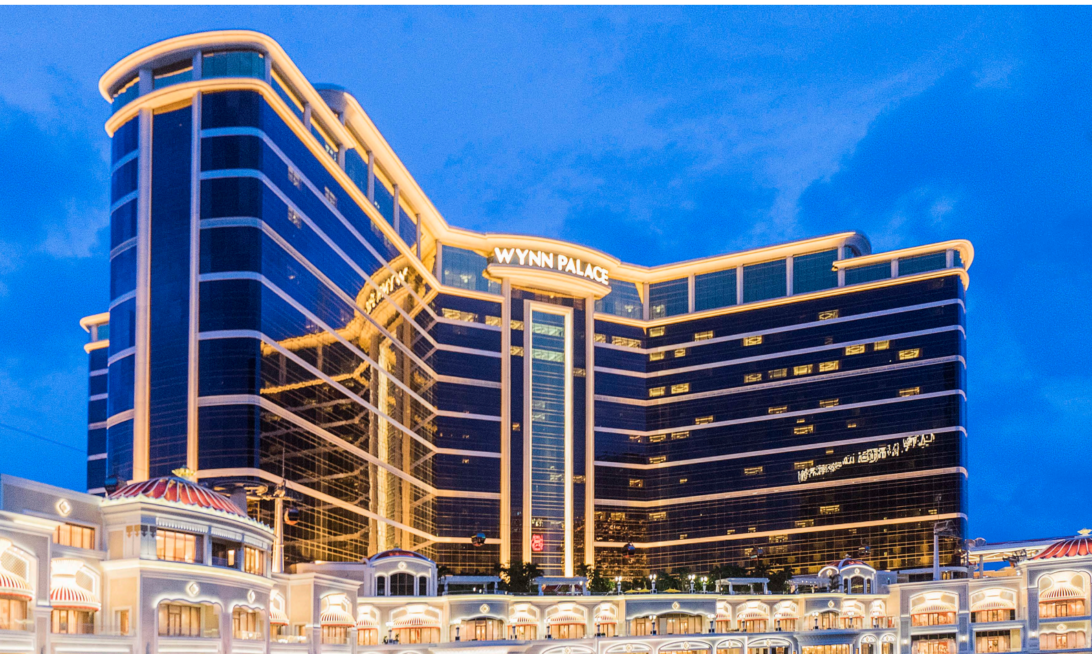
Wynn Palace, a new mega resort worth US$4.1 billion, opened in August after 6 years of development.

The two resorts have made almost 20,000 new hires and boast approximately 4,700 hotel rooms – a 15% increase in the existing room supply, which is the largest increase since 2009. All of these factors are expected to boost mass-market tourism and tourist spending, which will aid an economic recovery.