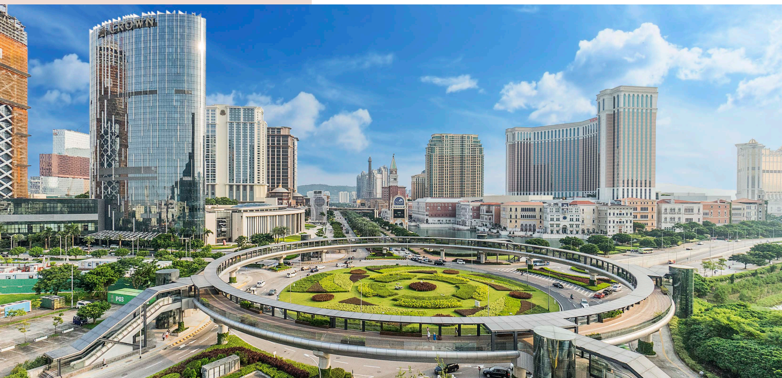
Footbridge connecting the integrated resorts in Cotai Strip to Taipa Village, an up-and-coming lifestyle destination in Macau.