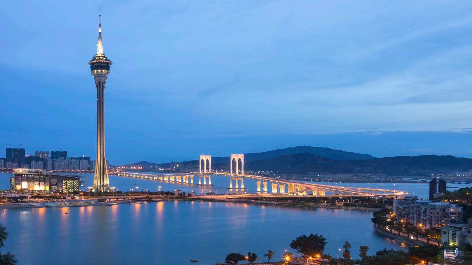
A breathtaking view of Macau's skyline from Estrada da Penha .