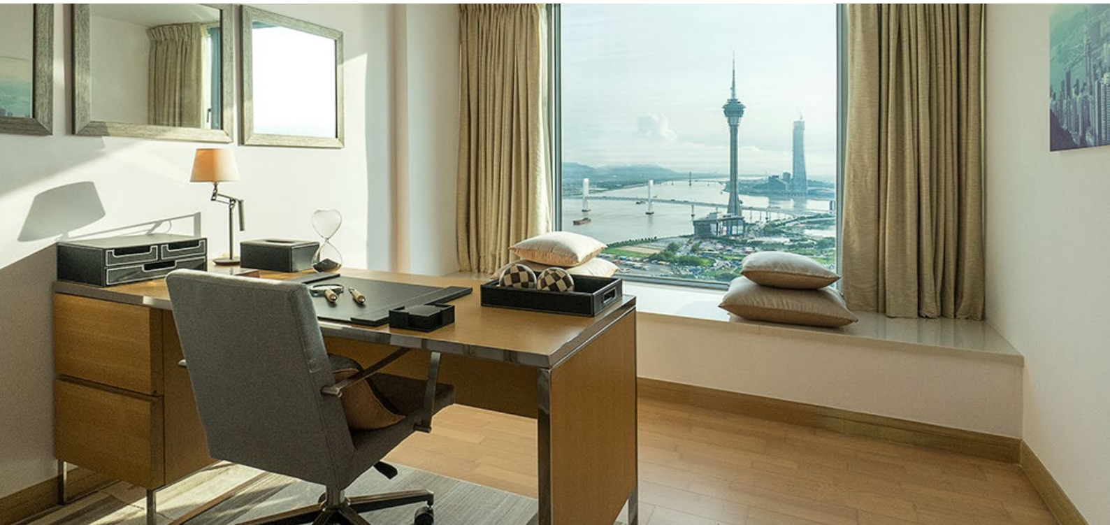
Study room of the Sapphire Suite at The Waterside .

The Company's annual financial results are due to be released in late September 2016.