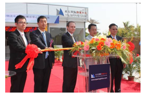
Officiating guest proclaiming launch of APAC Logistics Centre