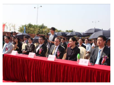
Over hundreds of government officials, industry leaders and media attended the opening ceremony

"MPO has captured an unprecedented growth opportunity in the region."