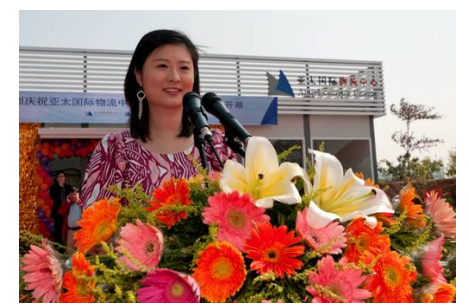
Master of Ceremony announcing the start of the opening ceremony