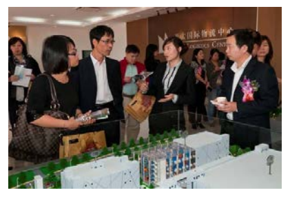
Guests expressing great interest in the potential of APAC Logistics Centre