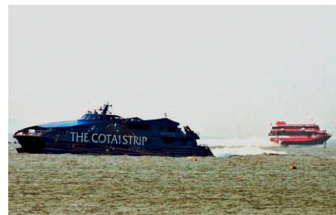
The expansion of CotaiJet ferry services will assist the flow of passenger traffic between Hong Kong and Macau, currently dominated by Turbojet (right).

The Macau Government is taking significant steps towards alleviating pedestrian border traffic congestion at the main border gate between Macau and China. An ambitious expansion project which commenced in June, will increase the daily handling capacity from 300,000 to 500,000 visitors.