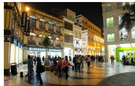
Senado Square, where Property 4 is located. This prime tourist area attracts heavy pedestrian traffic.

levels on completion of the project. The planning process has started with the appointment of a retail consultant to provide advice on the project's positioning, design and prospective tenant mix.