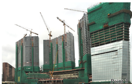
Latest construction progress of the premier mixed-use development One Central in which MPO owns Tower 6 and 25 individual residential units.

The Company is also in advanced discussions regarding construction financing for its redevelopment projects. Further details will be released in due course.