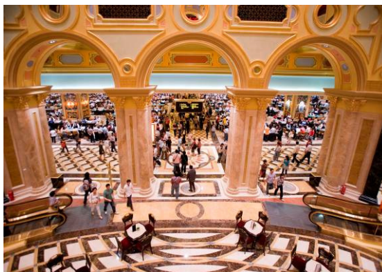
A view of Venetian Macao's 550,000 square feet gaming floor

We continue to believe that we are at a relatively early stage in the long-term regeneration cycle of Macau. The Territory's ongoing growth and transformation will be marked by key milestone events which will have the continuing effect of heightening international awareness and attracting an increasing number of visitors drawn by a broader range of product offerings. The opening of the western-backed casino, the Sands Macao in May 2004, was the first such major event followed by the launch of the Wynn Macao in late 2006. The instantaneous success of these and similar operations has confirmed the demand for western-style offerings as well as the significant growth potential of the mass gaming market (gaming revenues in Macau have historically been dominated by high roller VIP rooms).